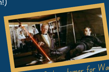
Another satisfied customer for Wackers