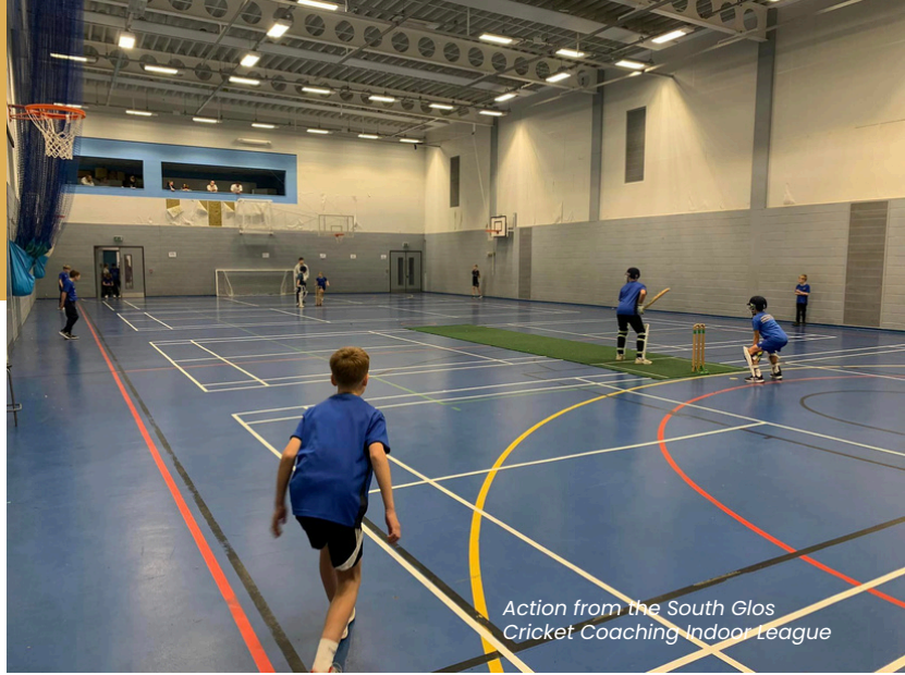
Action from the South Glos Cricket Coaching Indoor League