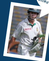
Glad I don't have to face this Wiggy bloke every week