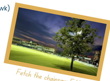
Fetch the chainsaw Eddie...